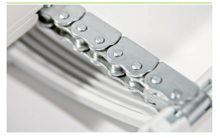
Robust double link chain for more thrust and traction force