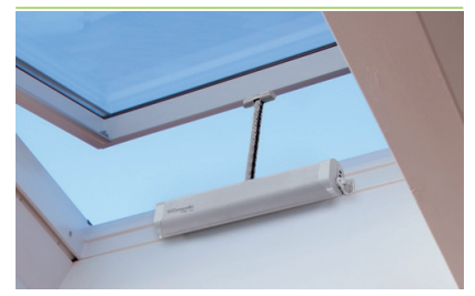
Limit switch with current limitation function: guarantee of safe and perfect closing over time