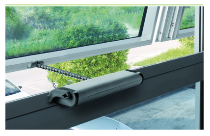
Obstacle detection and soft start and stop system for greater safety and precision.