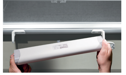
Quick-fastening system for installation without the use of screws