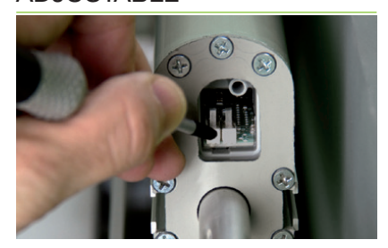
Up to 10 adjustable strokes by dip switch, also when motor is powered off. The Regulator model is equipped with millimetric adjustment.