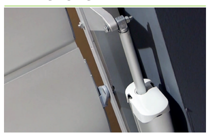
Closing limit switches with current limitation function: guarantee of safe and perfect closing over time