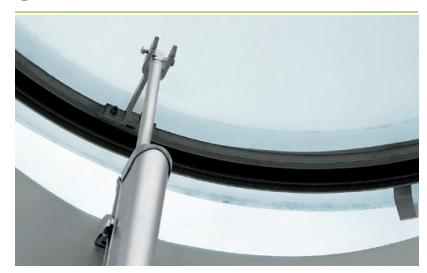
Obstacle detection and soft start and stop system for greater safety and precision.