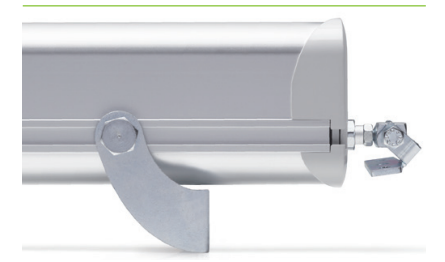
Adjustable fixing bracket on the device track for easy assembly.