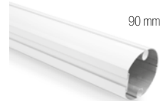
Circular barrier white RAL 9010 AC 731 -3m / GLTBAR30TOW00 AC 741 -4m / GLTBAR40TOW00 AC 751 -5m / GLTBAR50TOW00