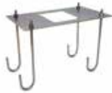
Foundation kit AC 510 / GLTANCH080G00