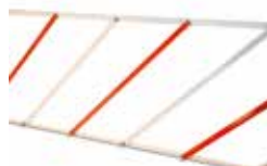
2 m curtain AC 590 / GLTHEDGE02W00