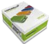
Kit 5 remote control, rolling code 2 ch. KITVICTOR / GVCTR2STN5C00