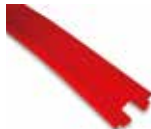
Red barrier bar cover AC 690 - 5m / GLTTOPP500R00