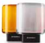
Flashing signal lights SWIFT YELLOW / GSWIFTSTLYB00 SWIFT WHITE / GSWIFTSTLWB00