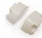
Bar end plug AC 700 / GLTSTOPPERW00