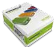
Kit 5 Remote control, rolling code 2 ch. KITVICTOR / GVCTR2STNSC00