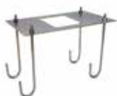
Foundation kit AC 500 / GLTANCHORO000