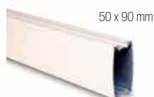
Aluminium rectangular bar, RAL 9010 AC 630 - 3m / GLTBAR3000W00 AC 640 - 4m / GLTBAR4000W00 AC 650 - 5m / GLTBAR5000W00